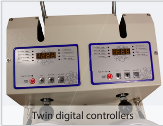
Twin digital controllers