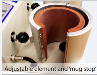
Adjustable element and 'mug stop'