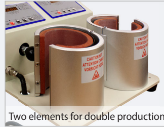
Two elements for double production