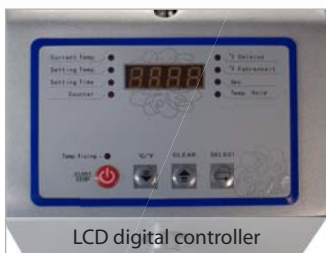
LCD digital controller