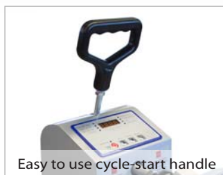
Easy to use cycle-start handle