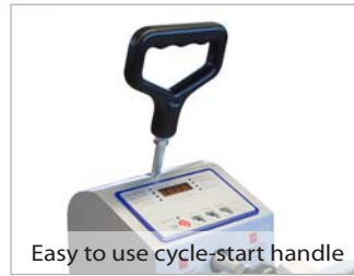
Easy to use cycle-start handle