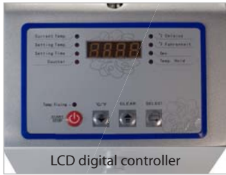
LCD digital controller