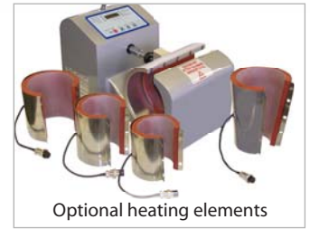
Optional heating elements