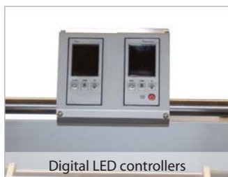
Digital LED controllers