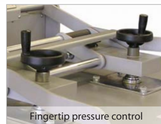
Fingertip pressure control