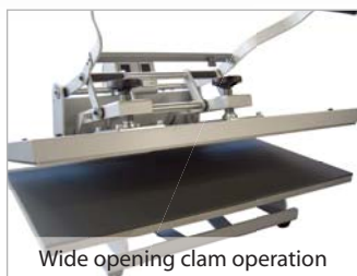
Wide opening clam operation