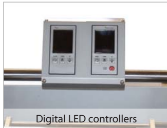
Digital LED controllers