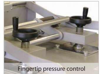
Fingertip pressure control