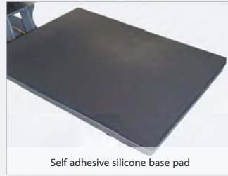
Self adhesive silicone base pad