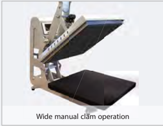
Wide manual clam operation