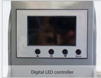
Digital LED controller