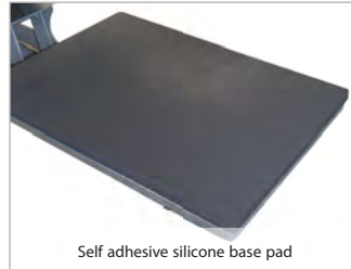
Self adhesive silicone base pad