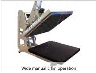
Wide manual clam operation