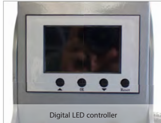
Digital LED controller