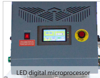
LED digital microprocessor