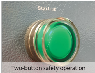
Two-button safety operation