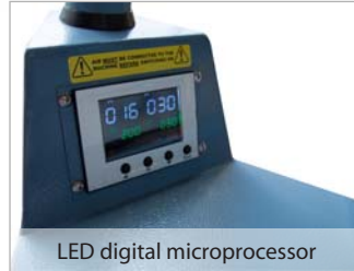
LED digital microprocessor