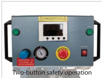
Two-button safety operation