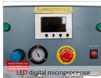
LED digital microprocessor