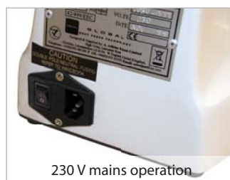
230 V mains operation