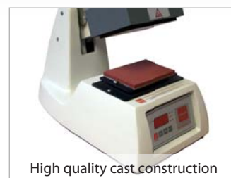
High quality cast construction