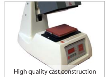
High quality cast construction