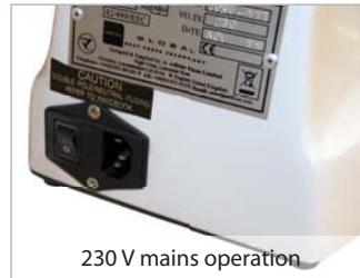
230 V mains operation