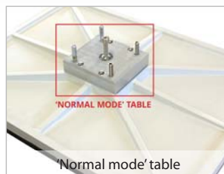
'Normal mode' table