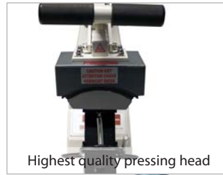
Highest quality pressing head