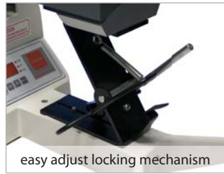
easy adjust locking mechanism