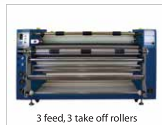
3 feed, 3 take off rollers