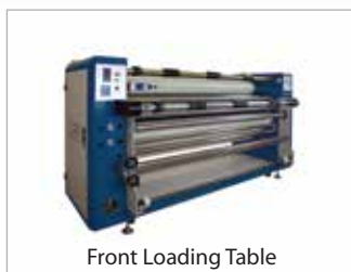
Front Loading Table