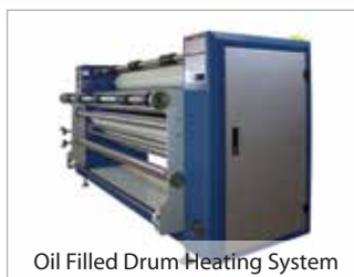
Oil Filled Drum Heating System