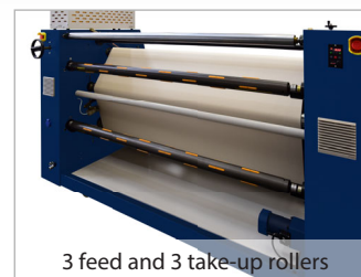
3 feed and 3 take-up rollers