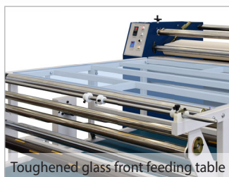
Toughened glass front feeding table