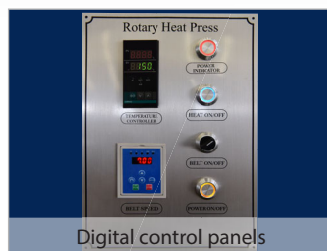
Digital control panels