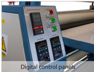
Digital control panels

Designed to perform with precision and speed