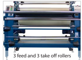
3 feed and 3 take off rollers