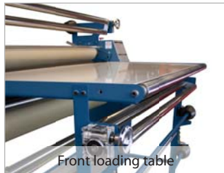
Front loading table