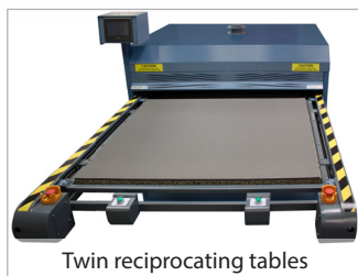
Twin reciprocating tables