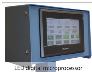
LED digital microprocessor