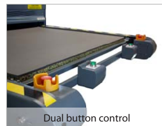
Dual button control