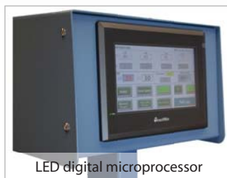
LED digital microprocessor