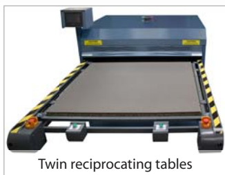
Twin reciprocating tables