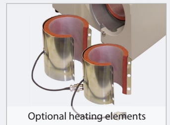
Optional heating elements