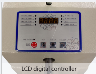
LCD digital controller