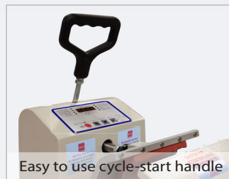
Easy to use cycle-start handle