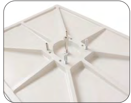
'HI-LIFT' MODE TABLE